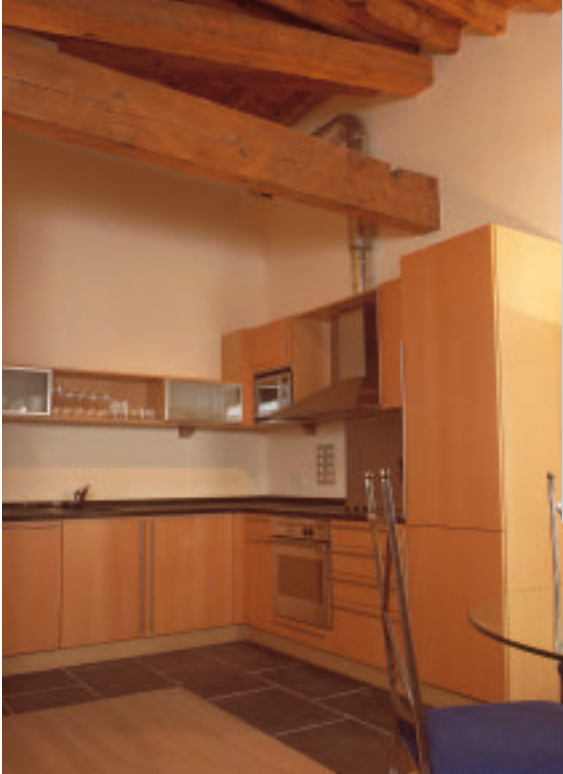
West India Quay Apartments.

Beautiful apartments for today's stylish living.