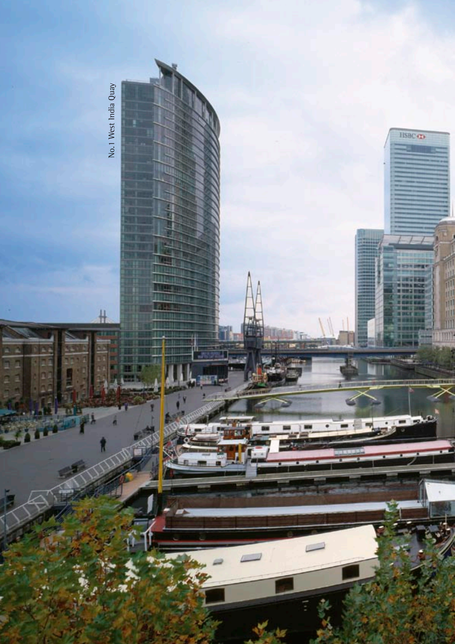
No.1 West India Quay